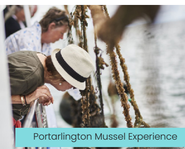
Portarlington Mussel Experience