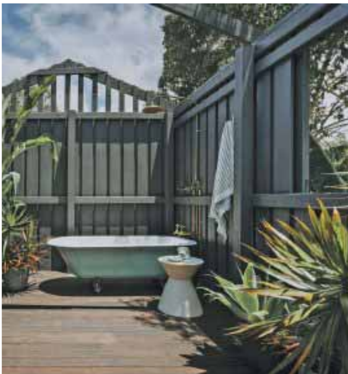
Clockwise from top: Surfside Motel Yeppoon; Toowoomba Carnival of Flowers; Pelorus Private Island, off Townsville; The Acreage at Woombye's Sixty6 Acres, Sunshine Coast. Opposite: Pelorus Island.

yeppoonsurfsidemotel.com.au ; funtasticcruises.com