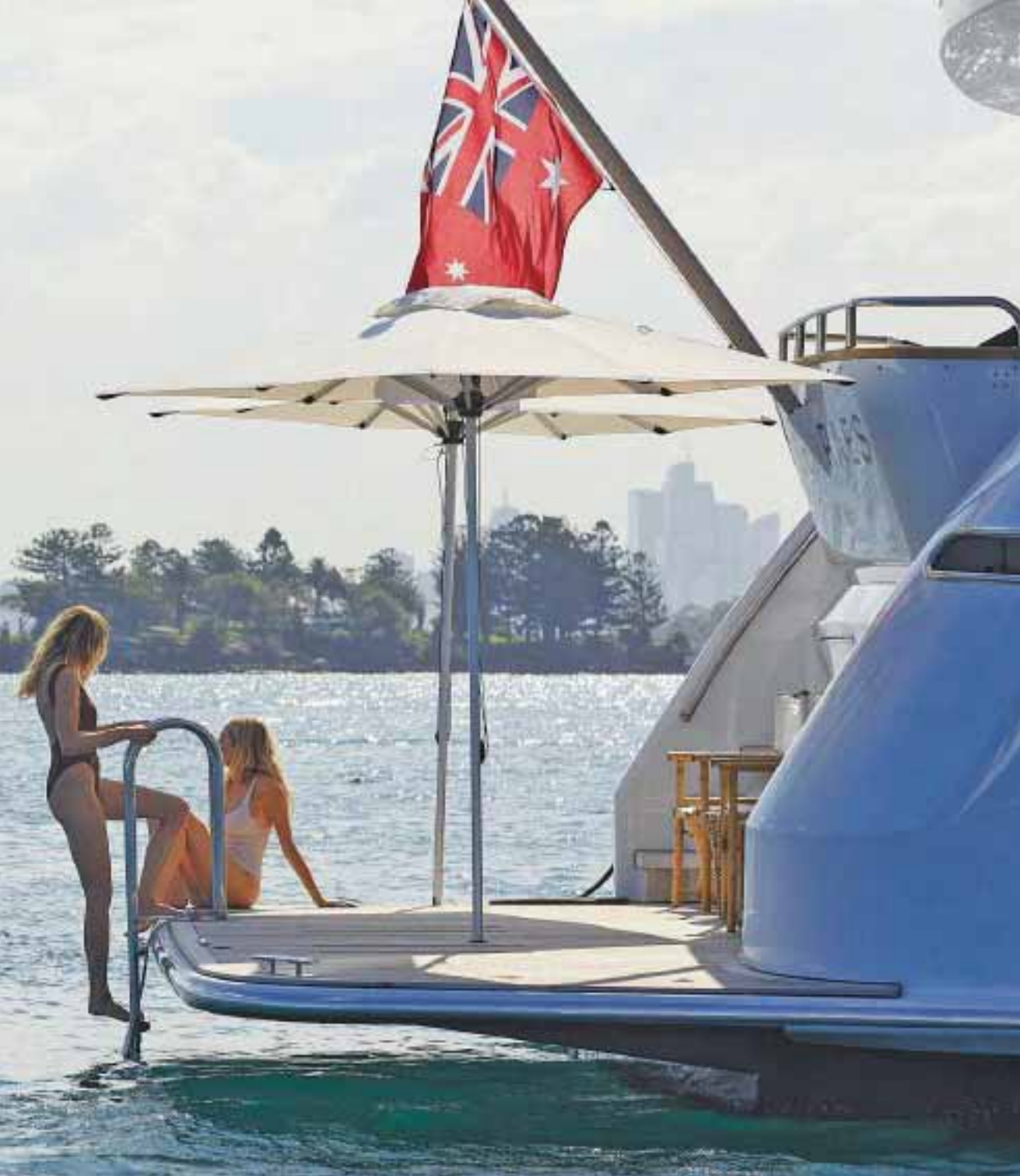
Clockwise from above: Sea Raes in Sydney Harbour; Shelter Brewing Co, Busselton; Beltana Farm, Canberra; The Cabin at Arcadia Nimbin, NSW; Bremer Bay, WA.