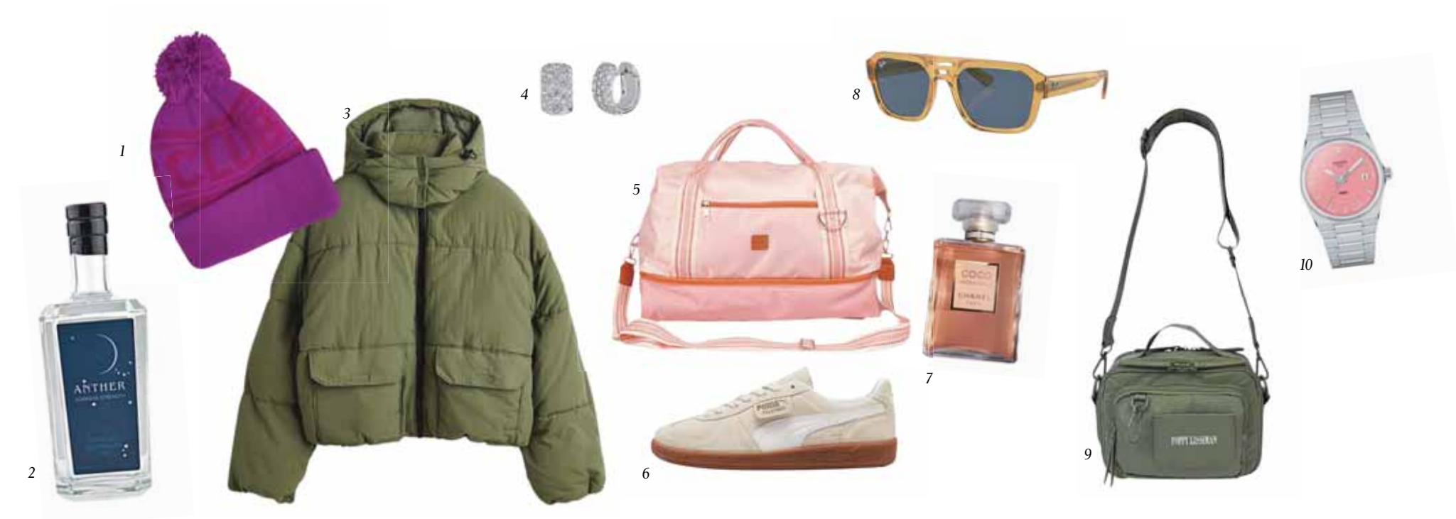
1. BoCub Club violet underground beanie, $44, from bocub.com.au; 2. Anther Goddess Strength gin, $120, from anther.com.au or Anther Distillery at Federal Mills; 3. Hooded puffer jacket, $89.99, from www2.hm.com; 4. Catherine earrings, POA, from Charles Rose; 5. Fairy Floss Weekender Bag, $160, from thesomewhereco.com; 6. Puma Palermo sneakers, RRP $150, from au.puma.com; 7. Coco Mademoiselle eau de parfum spray, from $138, from Myer, Westfield Geelong; 8. 9. Bento bag in army green, $155, from poppylissiman.com; 9. Ray Ban sunglasses, $218, from sunglasshut.com; 10. Tissot PRX, RRP $610, from tissotwatches.com/en-au;

WITH MOTHER'S DAY JUST AROUND THE CORNER, WE'VE MADE YOUR JOB EASY WITH THESE GORGEOUS GIFT IDEAS THAT ARE SURE TO IMPRESS